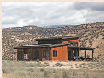
◀ PRECOURT FAMILY SWEETWATER CAMPUS