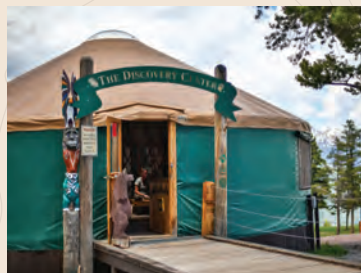
◀ NATURE DISCOVERY CENTER ON VAIL MOUNTAIN