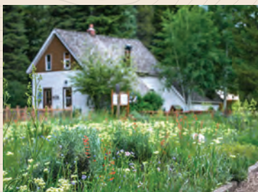
◀ VAIL NATURE CENTER IN FORD PARK