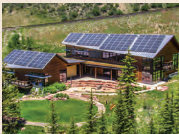
◀ AVON TANG CAMPUS