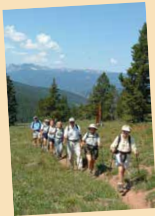
scenic aspen forests

Shrine Ridge - Perhaps the "most bang for your buck," this moderate trail offers amazing 360-degree views and an abundance of color during wildflower season. From the top of Shrine Mountain, you'll have an excellent view of Mt. Holy Cross (hence its name), as well as the Gore and Sawatch Ranges, Flattops, and Copper Mountain ski area. Difficulty rating: easy to moderate